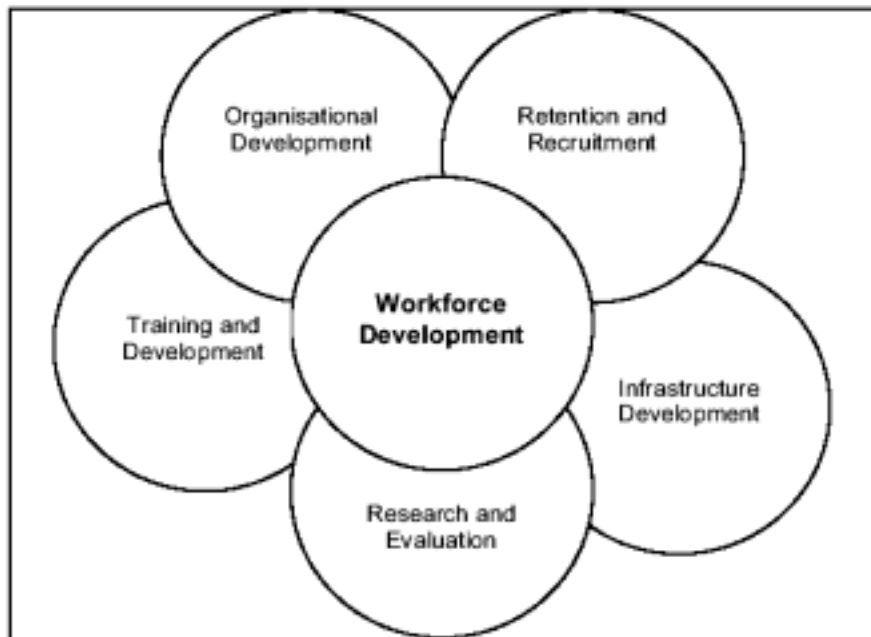
Figure 2. The Strategic Imperatives Model

This model is expressed in Figure 2 below